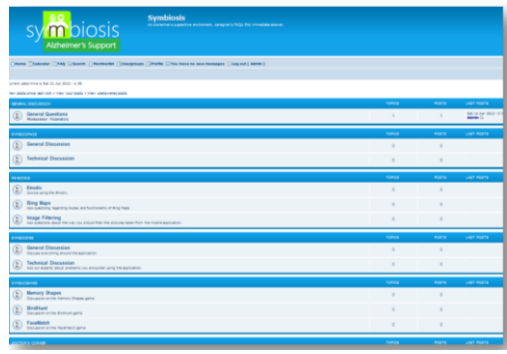
Fig. 7. SymbioProgess provides statistics on patient's interaction with Symbiosis (top); SymbioCircle is the Symbiosis forum for caregivers exchanging experiences and opinions (bottom).