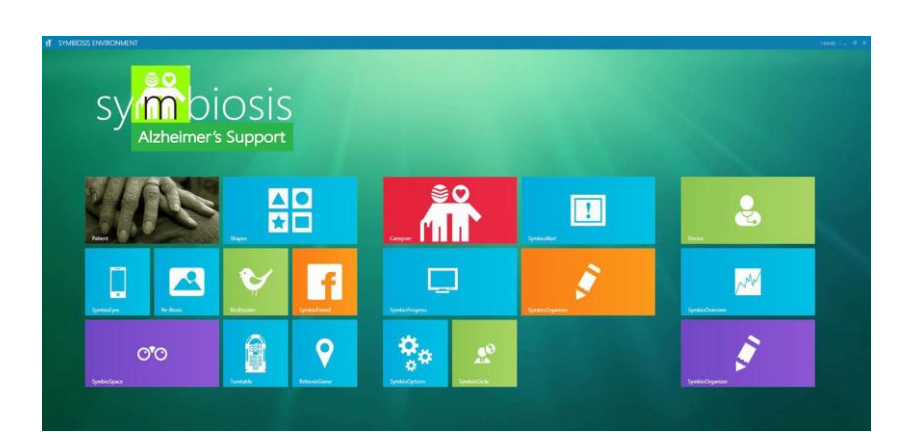
Fig. 2. The main GUI of the current version of Symbiosis.

SymbioGames is a gaming suite that offers a wide range of games aiming at exercising and improving skills such as memory, attention, orientation, visual and perception that gradually decline at the MCI stage of the disease. Furthermore, the novel humancomputer interaction strategy using Kinect sensor provides a natural user interface (NUI) that introduces the idea of combined physical and mental exercise (Fig. 3).