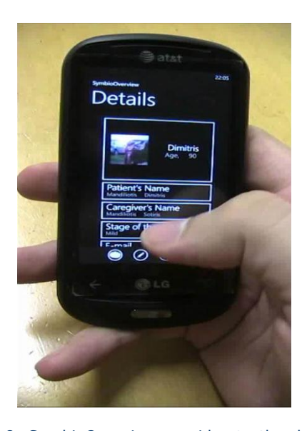
Fig. 8. SymbioOverview provides to the doctor statistics on patient's progress.