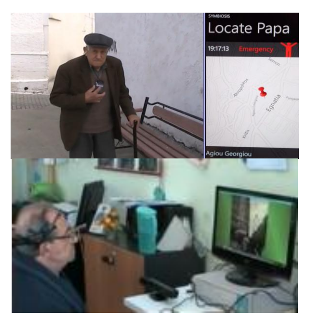
Fig. 6. SymbioEyes monitoring patient's location and status (top); Re-biosis captures the emotions of routing photos and uses the positively tagged ones for re-biosis of the causality of the routing, for efficient memory enhancement (bottom).

Re-biosis application downloads automatically from the cloud all photos taken by SymbioEyes application and creates slideshows. While these slideshows are presented to the patient, the photos are subjected to an emotional tagging procedure stemming from EEG signals processing that takes place at the background. The EEG signals are acquired through Emotiv EPOC headset (Fig. 6-bottom).