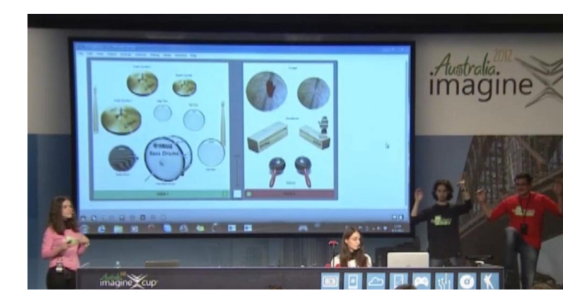
Fig. 5. Using just body movements, SymbioMusic provides to the users (right) collaborative music production with percussions (center).

Music has power-especially for individuals with Alzheimer's disease and related dementias. And it can spark compelling outcomes even in the very late stages of the disease. When used appropriately, music can shift mood, manage stressinduced agitation, stimulate interactions, facilitate positive cognitive function, and coordinate motor movements. Based on this fact, SymbioMusic offers a variety