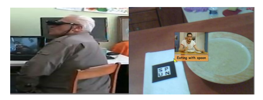
Fig. 4. Using AR glasses (left), Symbiospace provides to the user additional information for simple tasks, e.g., eating with spoon (right).

SymbioSpace application, using auxiliary auditory and visual effects forms a friendly environment for the patient via augmented reality (AR). It offers patient the opportunity to feel surrounded by a helpful environment that provides feedback and seems to interact